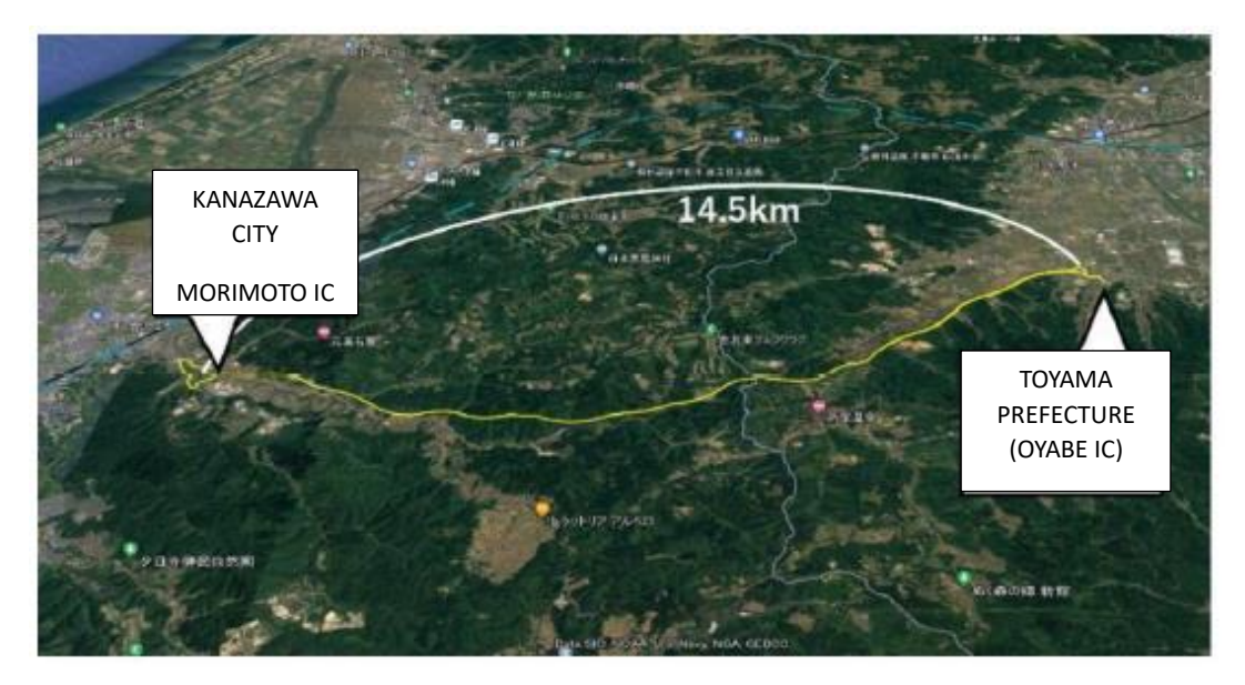
Figure 1. Measurement locations