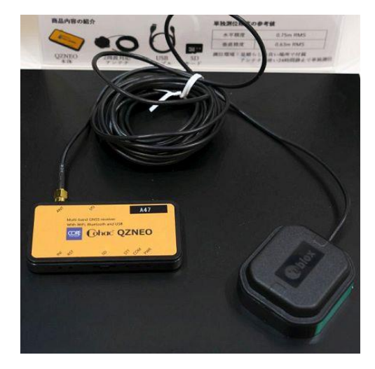
Figure 4. QZNEO Receiver (SLAS)