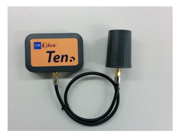
Figure 3. QZTEN Receiver (CLAS)